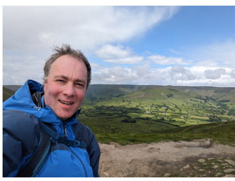
Summer travels took me to the Peak District.

elcome to the autumn issue of the St John's Parish Magazine. Autumn is one of my favourite times of the year - especially living right by the Common, and getting to see all the changing colours. In the church, it's a time when we reflect – first on the gifts of creation at Harvest, and then on those who have gone from this world to be with God. You'll see details of all these and more in this magazine.