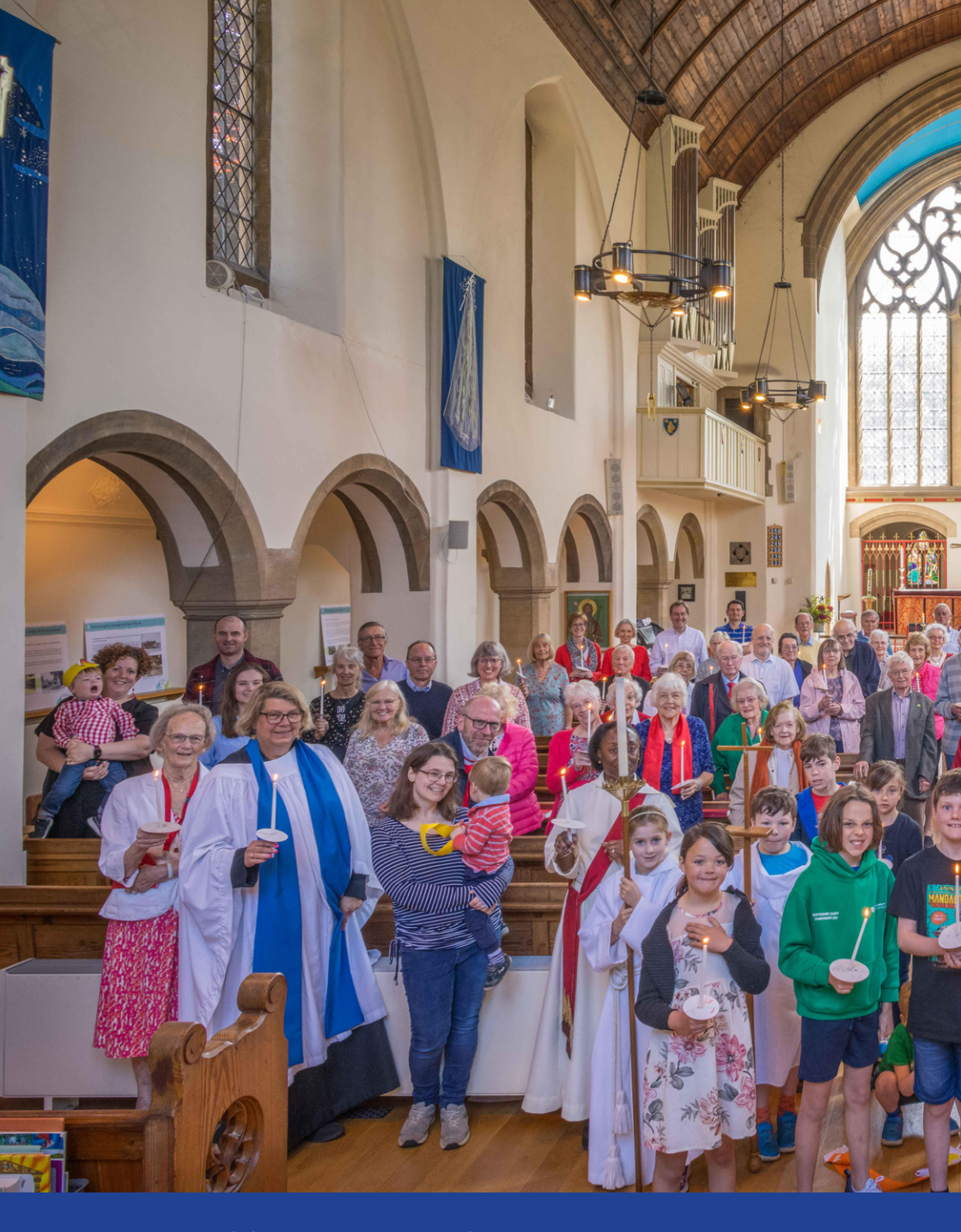
All Together Now!