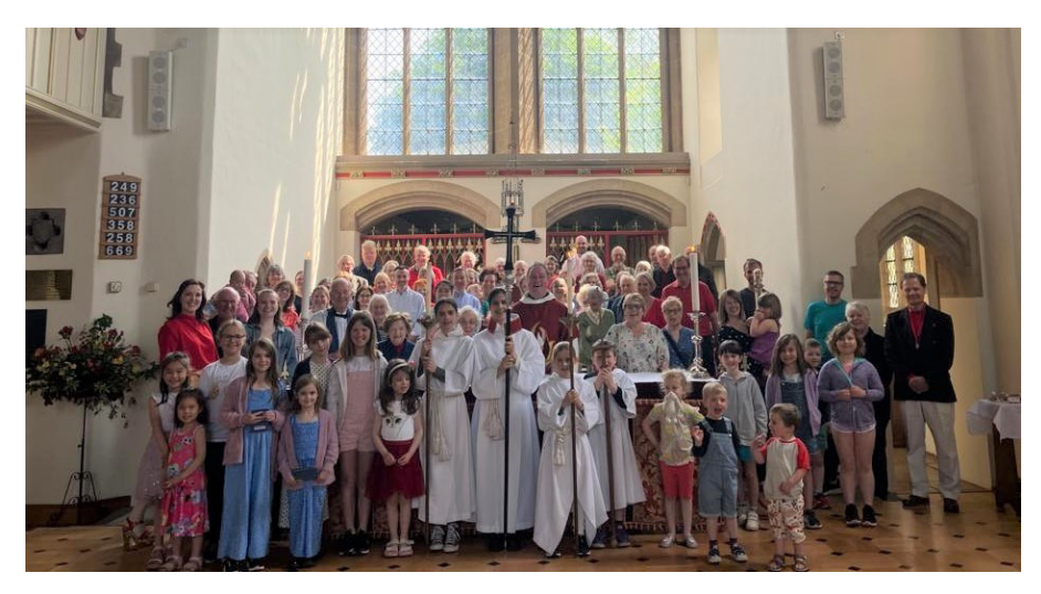
A warm welcome awaits you at St John's Harpenden, a friendly Anglican church. This photo was taken at Pentecost (Whitsunday) on 28th May 2023.