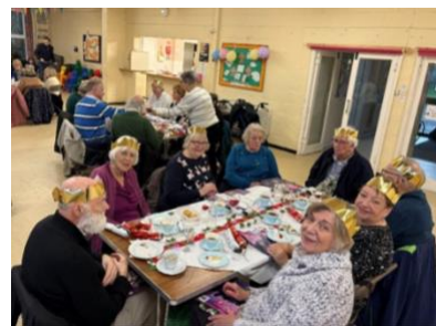
Junior Choir sing for our Christmas T@3